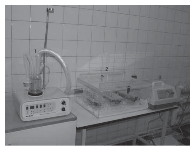
Figure 2. An inhalation challenge set for mice before inhalation. 1) ultrasonic aerosol generator, 2) inhalation chamber, 3) vacuum pump.

1) ultrasonic aerosol generator, 1-A) upper vessel of the nebulizing chamber, 1-B) lower vessel of the nebulizing chamber with piezoelectric converter, 1-C) notched aerosol pipe transporting aerosol, 2) airtight inhalation chamber, 2-A) perforated containers for mice, 2-B) mounted filter, 3) vacuum pump.