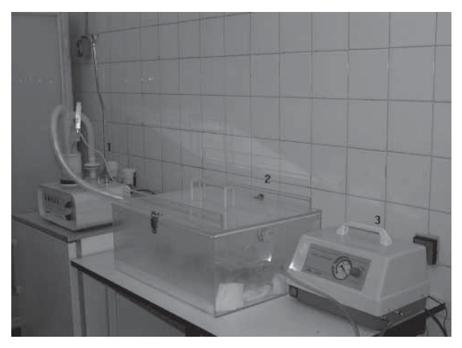
Figure 3. An inhalation challenge set for mice during inhalation. The chamber is filled with nebulized allergen extract.

1) ultrasonic aerosol generator, 2) inhalation chamber, 3) vacuum pump.